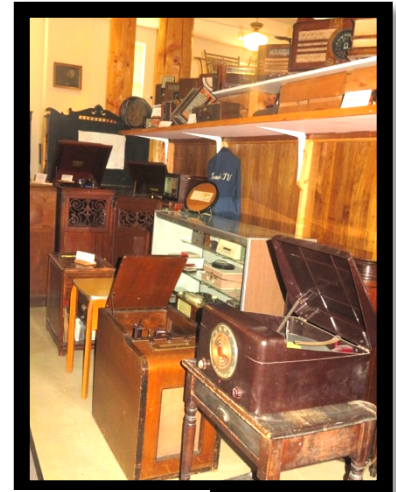
Music, music, music – lovely display of all things musical