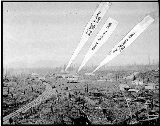
Arlington late 1800's